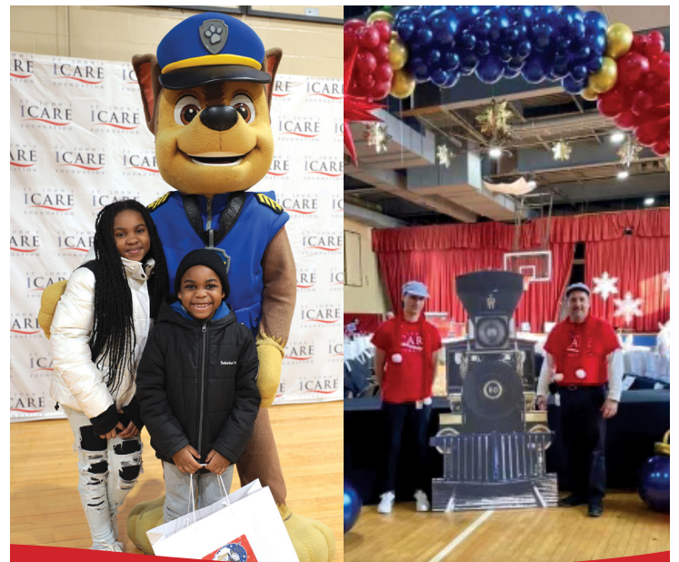
"Chase" from Paw Patrol stopped by ICARE's Holiday Toy Train event at the Five Towns Community Center.