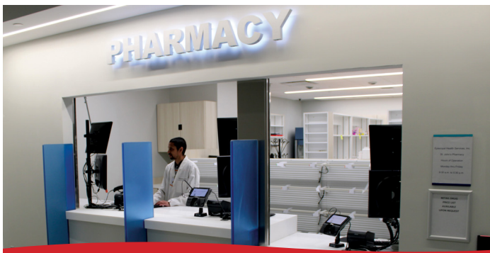
St. John's Episcopal Hospital features a retail pharmacy in the lobby.