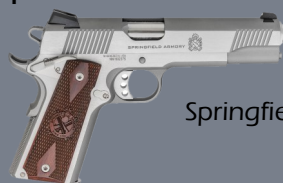
Springfield 1911 45 Cal Pistol