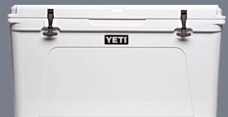
Yeti 105 Cooler