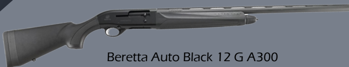
Beretta Auto Black 12 G A300