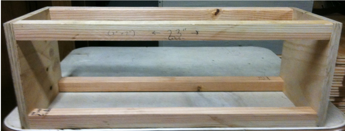
NEST BOX ASSEMBLY FRAME-(JIG) Side & End View

To make the Jig frame, use (4)-2 x 2 inch pieces of wood cut 23 inches long. Cut two pieces of plywood 10 5 / 8 x 10 5 / 8 inches and attach to the ends with screws. The hole template is used as a guide to cut out the entry hole and should be placed 2½ inches down from the top of the box. Make the hole template 11¾ inches wide to help center the hole. The entry hole needs to be 3 inches high x 4 inches wide (elliptical-oval).