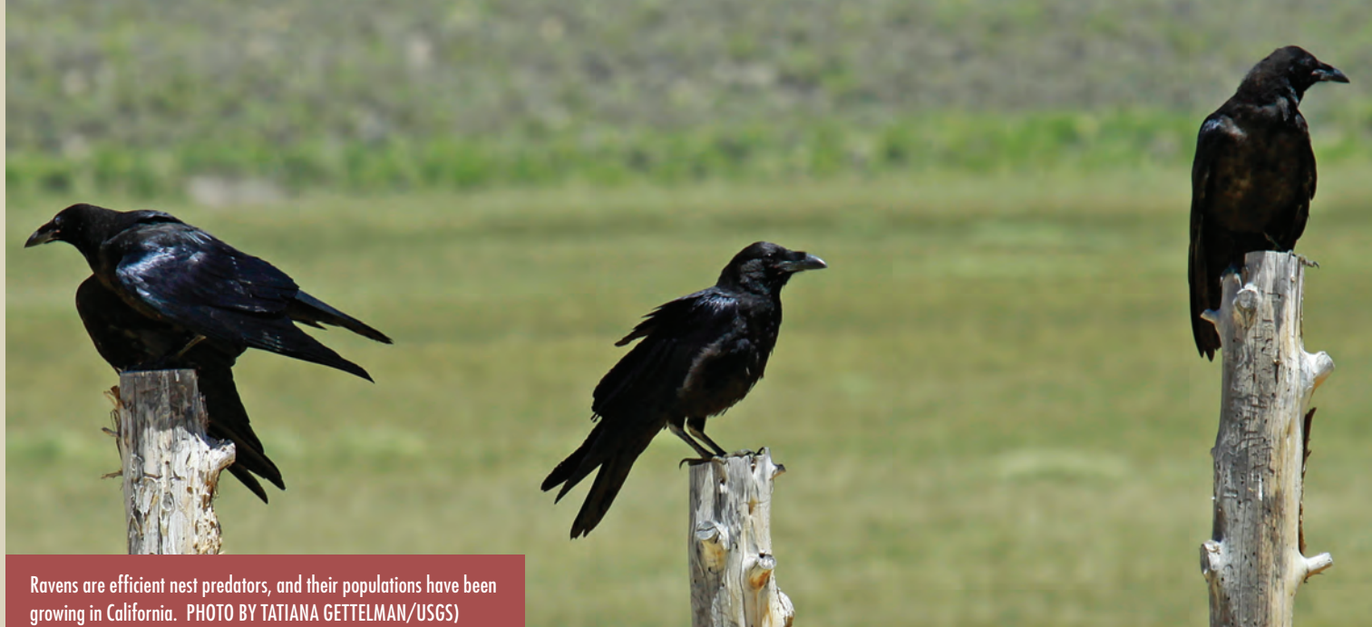
Ravens are efficient nest predators, and their populations have been growing in California.

agricultural areas used by pheasant, decreases the land's ability to sustain wild pheasant populations. This appears to have led to declines in pheasant numbers in prime hunting areas.