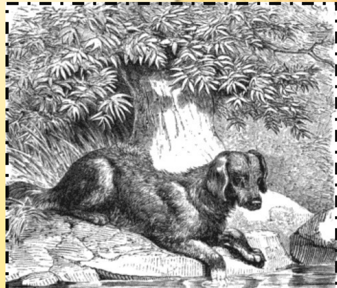
St. John's Water Dog using it's paw to try and lure fish close enough to catch