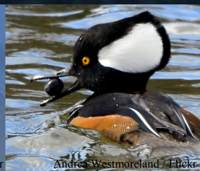
Andrea Westmoreland / Flickr