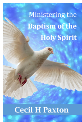
Ministering the Baptism of the Holy Spirit Book $10 sugg. don.