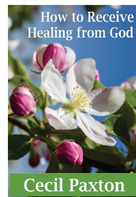
How to Receive Healing from God Book $20 sugg. don.