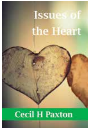
Issues of the Heart Book $15 sugg. don.