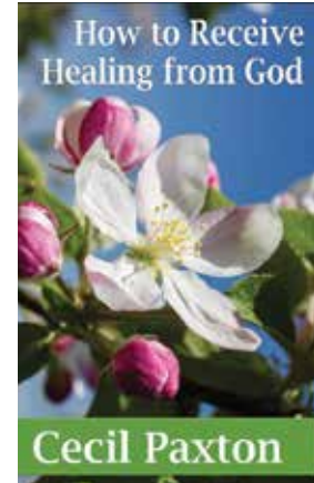
How to Receive Healing from God Book $20 sugg. don.