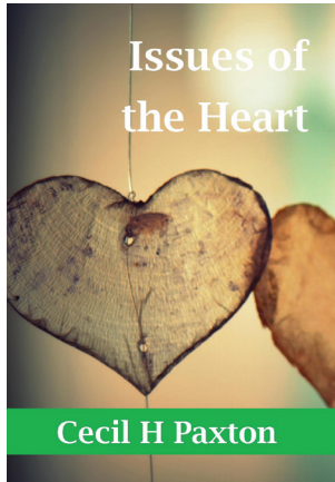
Issues of the Heart Book $15 sugg. don.