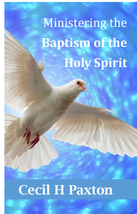
Ministering the Baptism of the Holy Spirit Book $10 sugg. don.