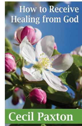
How to Receive Healing from God Book $20 sugg. don.