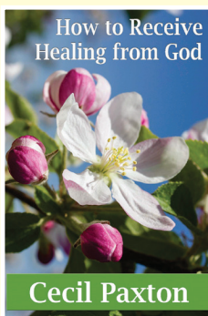
How to Receive Healing from God Book $20 Item B001