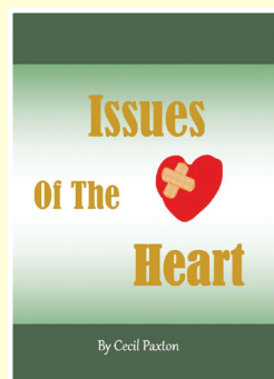
Issues of the Heart 4 CD's $28 Item 4015