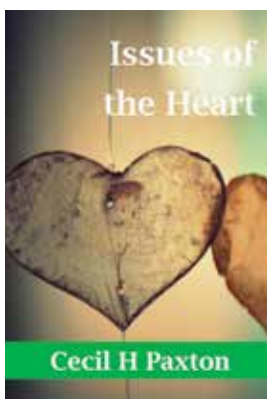
Issues of the Heart Book $15 sugg. don.