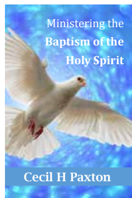
Ministering the Baptism of the Holy Spirit Book $10 sugg. don.