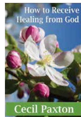
How to Receive Healing from God Book $20 sugg. don.