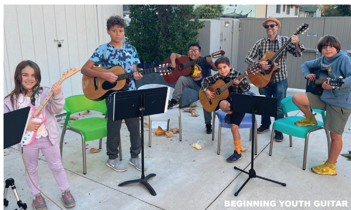
BEGINNING YOUTH GUITAR