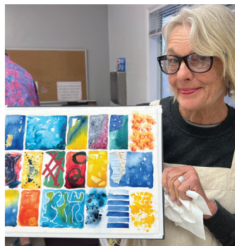
EXPLORING TEXTURES IN WATERCOLOR