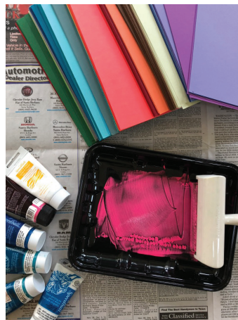
BLOCK PRINT - COHEN