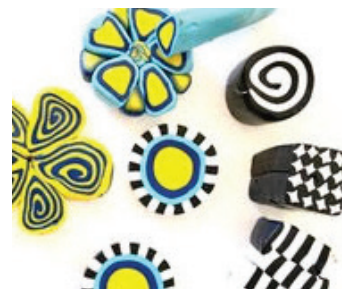
POLYMER CLAY - CARR