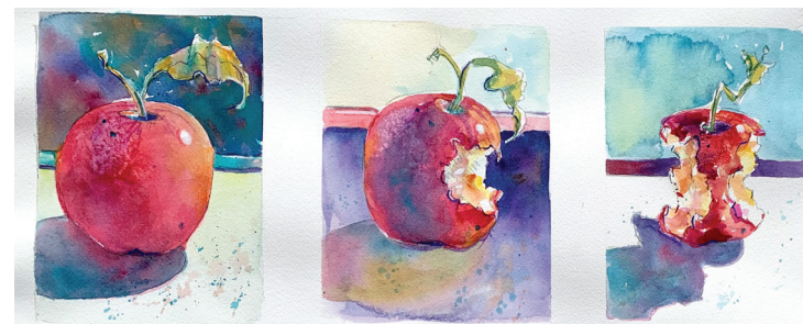
WC TRYPTICH - QUIEL

Price: $75/$68 members per session or $200/$180 members for all three sessions