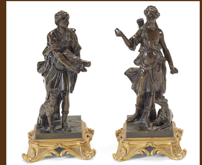
A PAIR OF BRONZE FIGURES OF DIANA AND MÉLÉAGER

Ranked No. 1 for its influence on global innovation, Scripps Research celebrates its 17th year of high-impact science in Palm Beach County in 2021. For more information visit www.scripps.edu .