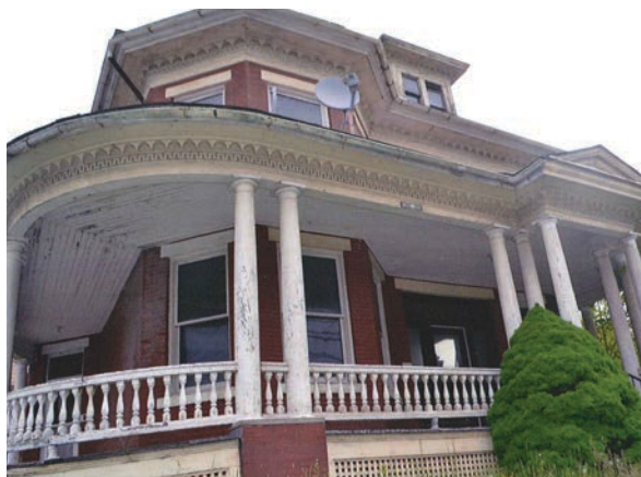
The new homeless shelter at 899 Bedford St., Johnstown