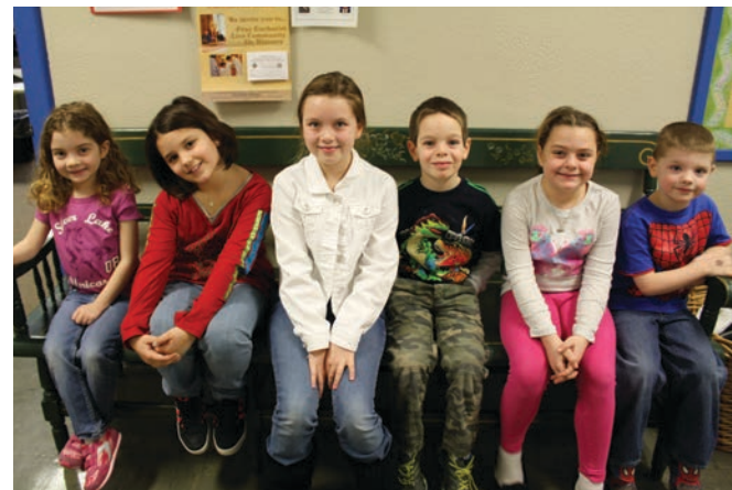
Students at St. John the Evangelist Catholic School in Bellefonte participated in $0.50 dress down days on Fridays during the month of May to support their local office of Catholic Charities.