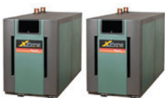
The planned new Tandem Boiler configuration for the Chapter House