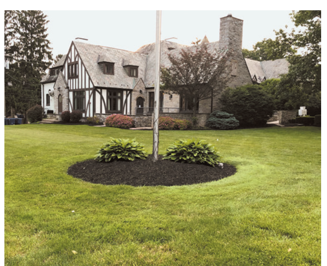
"We did a lot of work last summer on the House..."