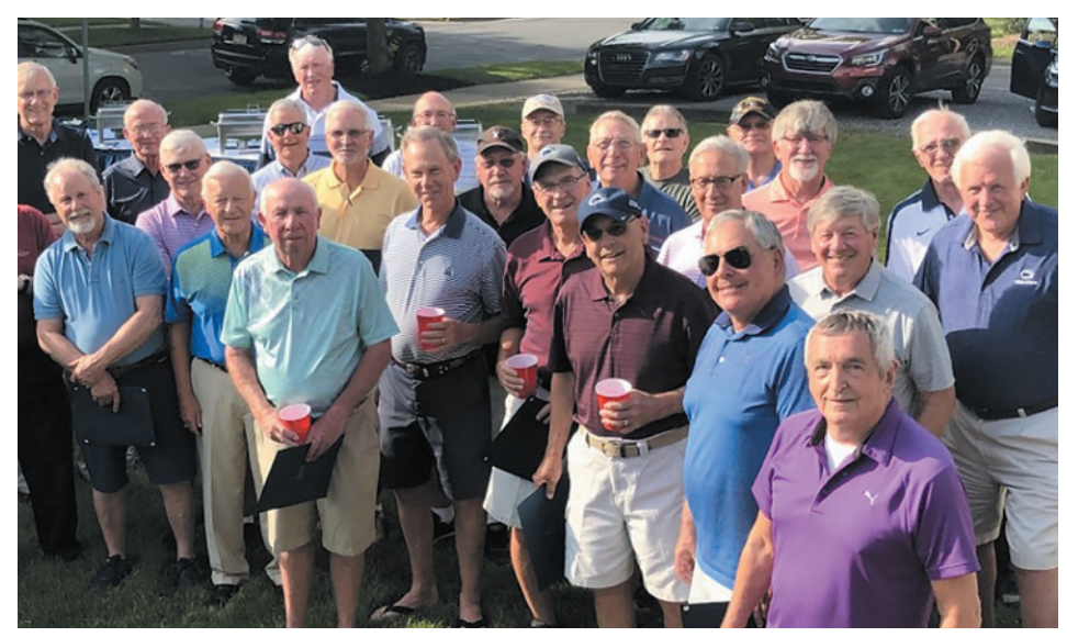
Alpha Chi recognized brothers who have been Brothers for more than 50 years. Each Brother got a Pin and a Certificate.

Sigma Chi is a lifelong obligation and our alumni continue to show up for our events, including our 30<sup>th</sup> annual Alumni Weekend coming in June 5<sup>th</sup>-7<sup>th</sup> 2020. Our Chapter thrives when Alumni spend time with them and we are looking for more Alumni (young and old) to interact with our Chapter. Finally, we can't operate without donations and any amount you can give is sincerely appreciated.