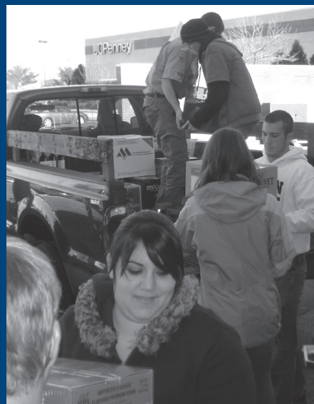
Volunteers work to unload boxes of food during the Scouting for Food drive.

Once again this year, Boy and Girl Scout troops, along with volunteers from Penn State and the local community, worked together to gather, unload, organize, box up, and deliver 20,000 pounds of food. Thanks to everyone who made the 2011 Scouting for Food drive a success! Your contributions of food and volunteer time help ensure that our neighbors who need food or a holiday meal can find help at Centre County food banks.