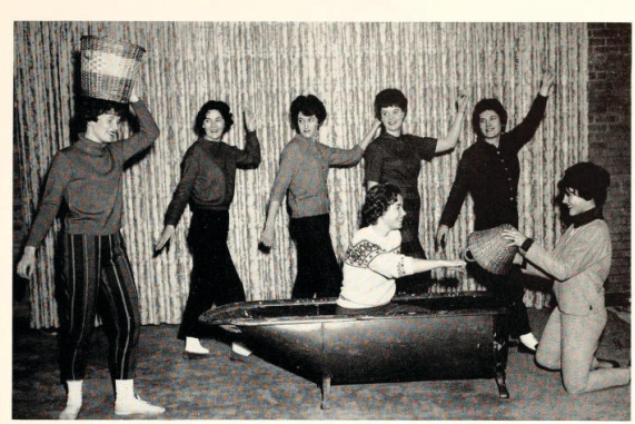
A shocking pink bathtub is worked into a dance routine as Alpha Chi Omegas practice for the Y-Orpheum produc-