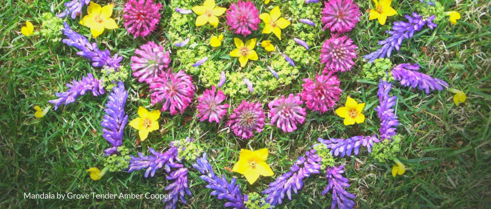
Mandala by Grove Tender Amber Cooper

Several things stood out from these days: