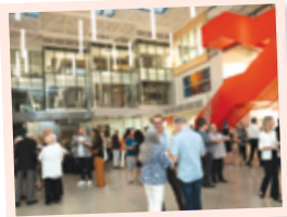
Event Space and Coworking