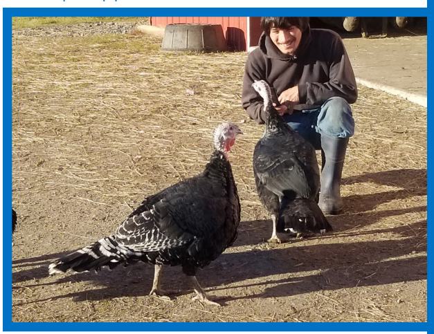
Friends of Hope: <$100