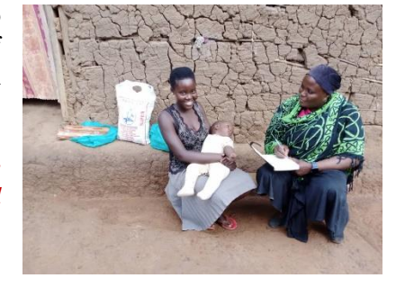
for babies. In the right picture is the teen mom and her baby in Lyantonde who received food and milk support.

Some teen moms have had challenges with reduced milk production and this month we managed to get them the best local porridge for nursing mothers as recommended by the Pediatricians. We are observing to see the results of this intervention within the next month starting with the new postnatal mothers.