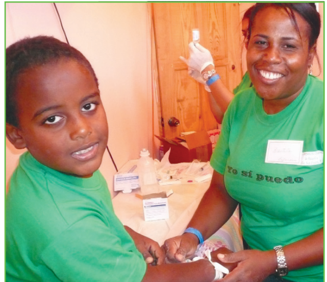
Save One Life sponsors camps where children with hemophilia receive free blood clotting medicine.