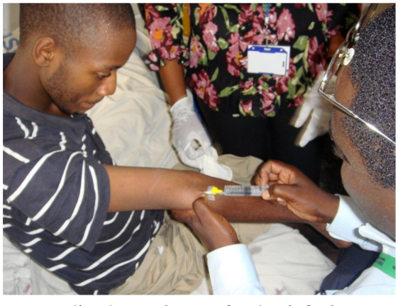
A patient receives a factor infusion.

Project SHARE ensures that tens of millions of dollars worth of factor, which would otherwise be destroyed, reaches impoverished people with bleeding disorders. This factor comes mainly from US patients who switch products, hemophilia treatment centers (HTCs), and specialty pharmacies with excess inventory.