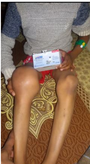
A boy in Yemen receiving a shipment from Project SHARE