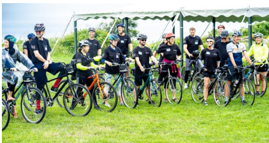
All geared up and ready to go!