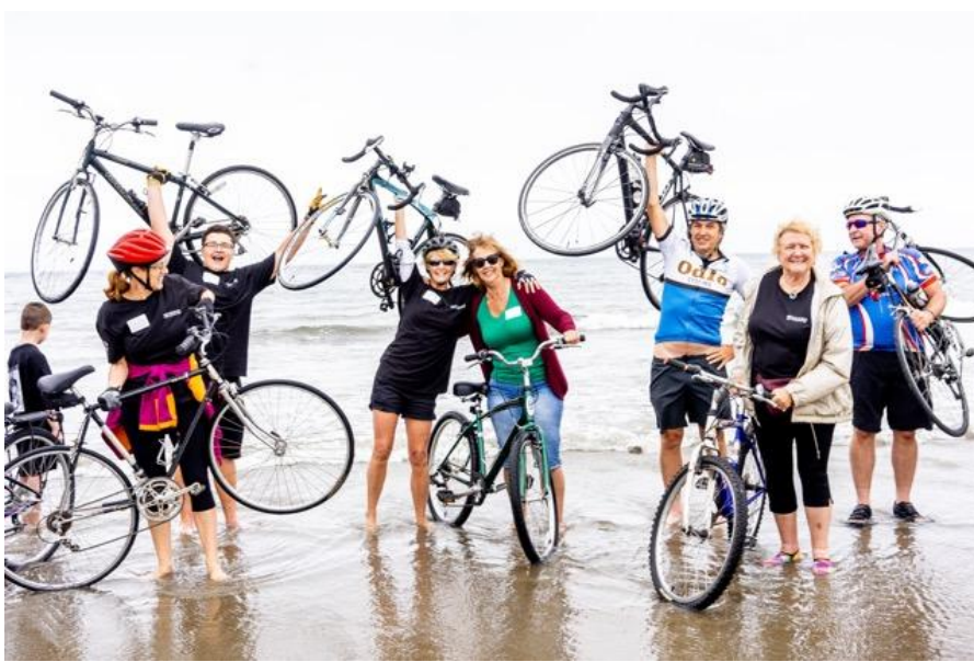
An unforgettable moment at Wallis Sands Beach.