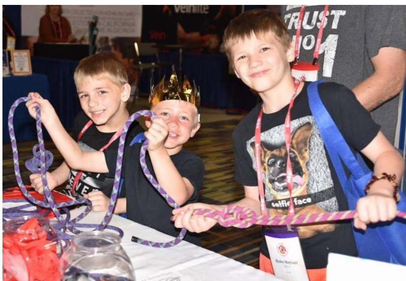
Tying knots to win free Bombardier Blood Raffle tickets.