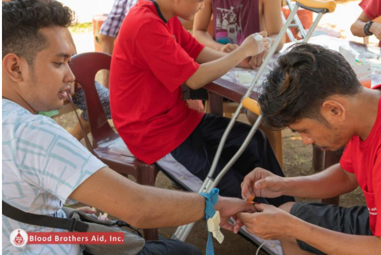
Teaching how to infuse at the Blood Brothers Aid camp in the Philippines.