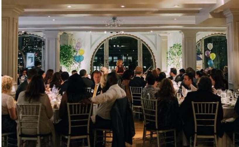
A warm and festive spirit of celebration was enjoyed by all.

More than 130 enthusiastic guests arrived at the Manhattan Penthouse in New York City on September 29 to mark a very special occasion...Save One Life's 15th anniversary!