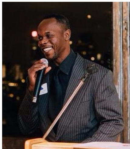
Our special guest, Tony Fernández