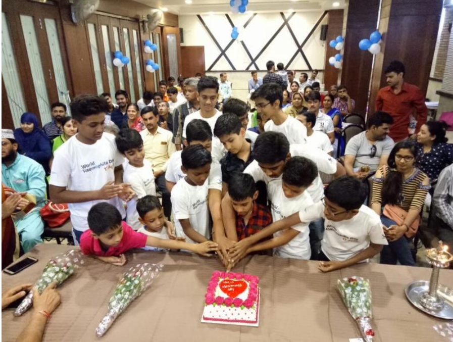
Usha celebrated World Hemophilia Day with members during her assessment visit to Indore chapter.