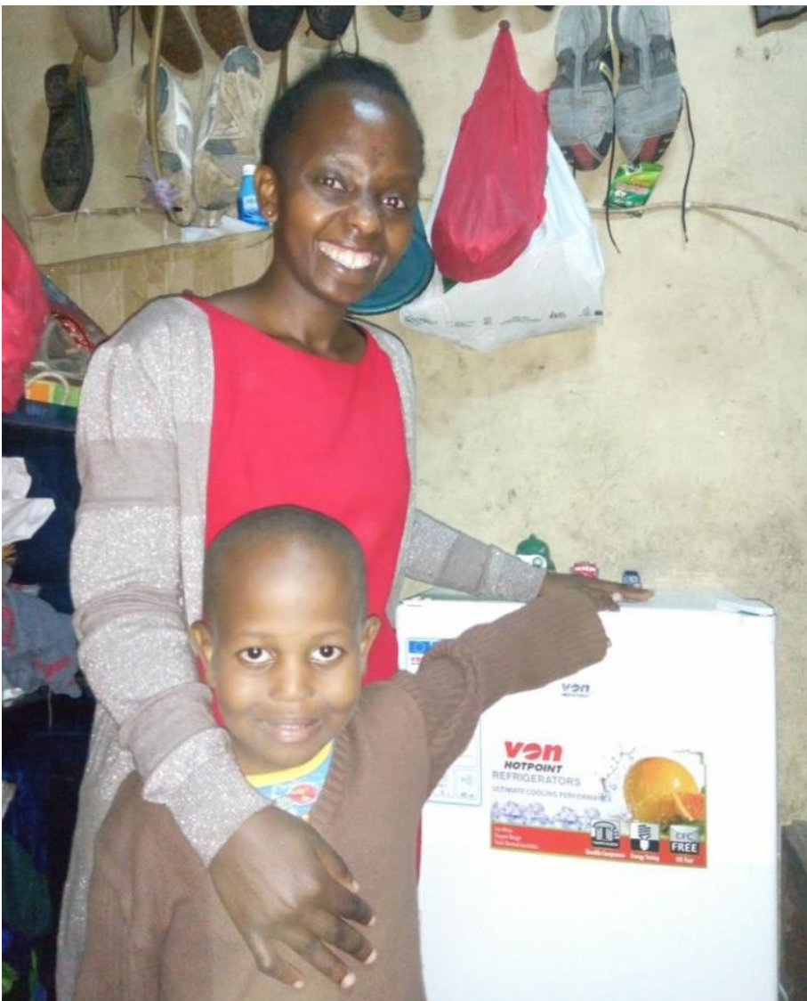
A happy family thanks to a sponsor's generosity!