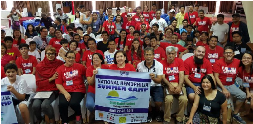
Congratulations to Hemophilia Advocates of the Philippines for a successful first national camp.