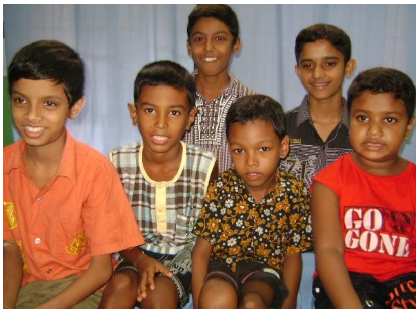
Young members of the Hemophilia Society of Bangladesh

We look forward to having children available to sponsor very soon!