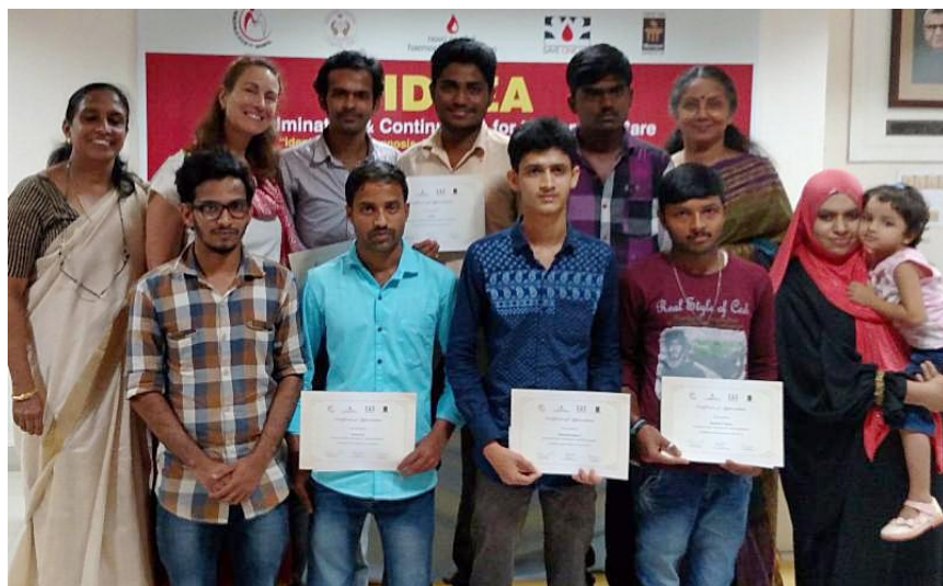
Current and former scholarship recipients of the IDEEA project, of which Save One Life was a sub-grantee