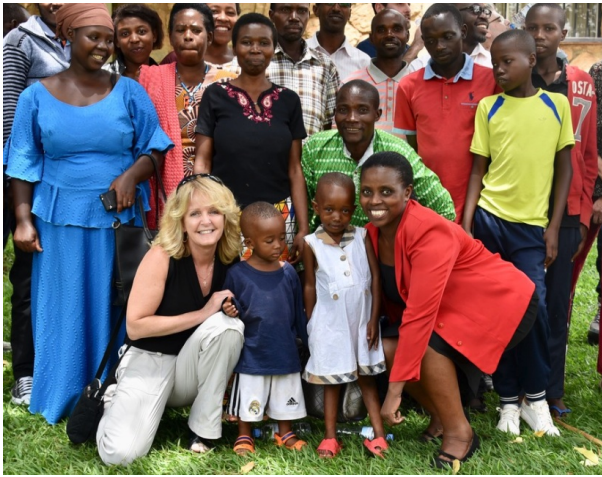
Meeting with the Rwanda Fraternity Against Haemophilia