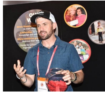
Representing Save One Life as a board member at an NHF annual meeting