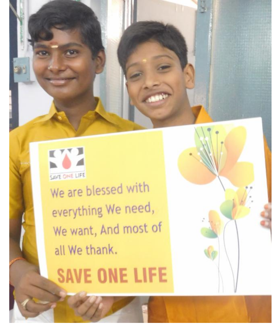
Beneficiaries from Chennai, India, appreciating what we do!