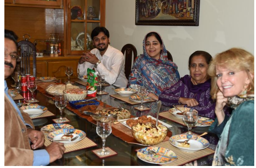
Enjoying a delicious dinner with hemophilia leaders.