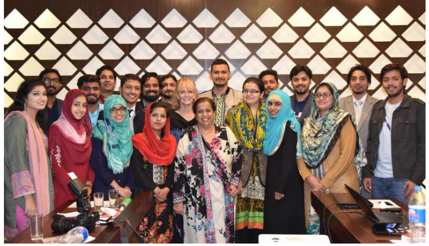
Attending a women and youth group meeting in Lahore.