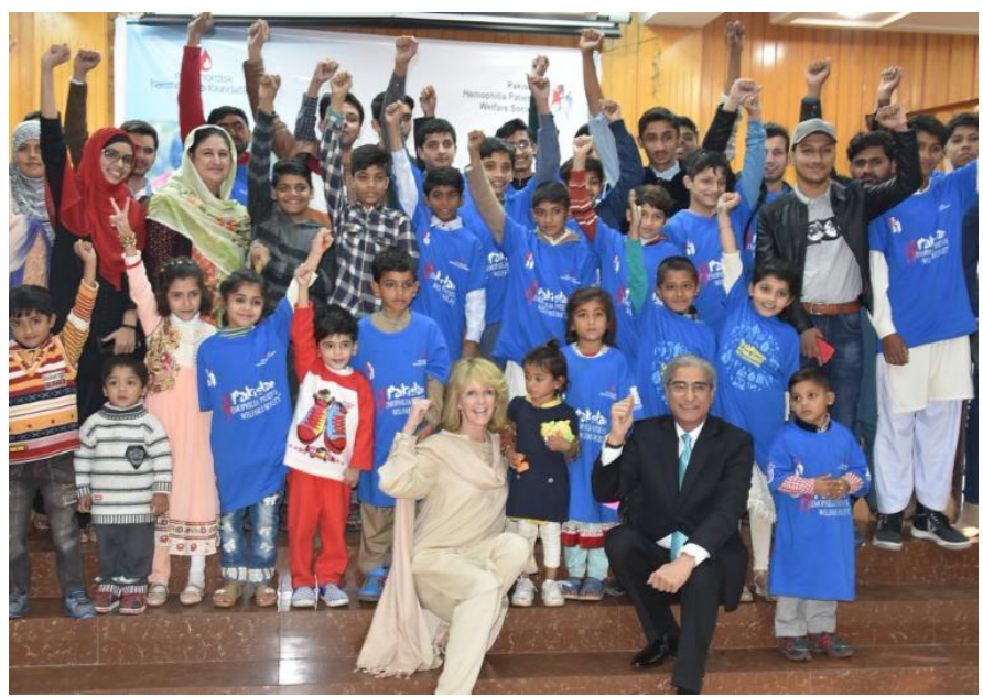
Looking at a brighter future for bleeding disorders in Pakistan!