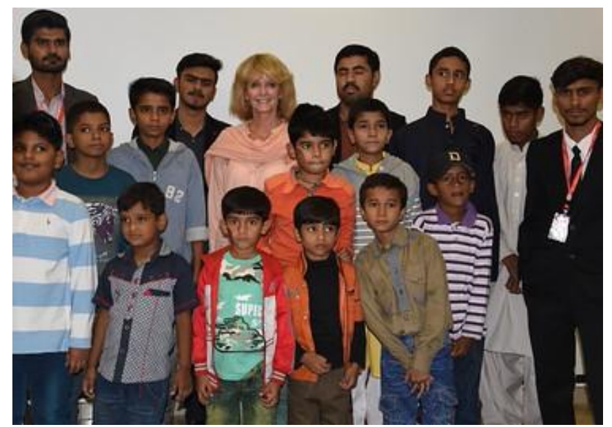
With Save One Life beneficiaries in Karachi.