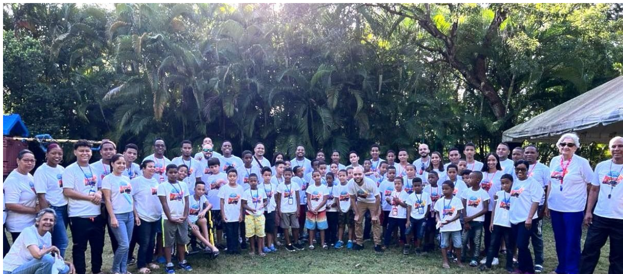
Summer camp fun in Lomas Lindas, Dominican Republic.

Thank you to all who support Save One Life and our programs, like the Bleeding Disorders Camp Fund, that help so many people worldwide.