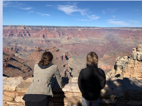
Grand Canyon Challenge October 14-18