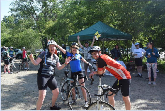
Wheels for the World Sunday, September 13.

Due to the current public health crisis and for the safety of everyone involved, we have rescheduled upcoming events.