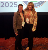
Ascend Sexual Risk Avoidance Conference

June was a busy month for us as well. We started off with the Ascend Sexual Risk Avoidance Conference in Cleveland, Ohio . We were able to showcase our newest Sexual Risk Avoidance materials and attend sessions to enhance our knowledge, ensuring we have the most current materials that resonate with young adults today. Following this, we quickly hopped on a plane to attend the National Right to Life Conference in Overland Park, Kansas , where we connected with various Right to Life groups from across the country. We discussed their needs for sidewalk advocates and how we can update our materials to best suit those needs.