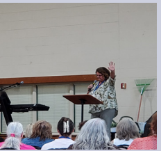
Life Matters Worldwide Summit

In May, we participated in the Life Matters Worldwide Summit , which brought together pregnancy centers from across Michigan to foster learning and collaboration. Life Matters Worldwide emphasizes that staff should not feel overwhelmed or unsupported. The summit provides opportunities for spiritual renewal, practical coaching, and community support. Also in May, Guardian Angels Church offered an exhibitor table at their Respect Life Spaghetti Dinner , where they partnered with a local pregnancy center to better inform their congregation about what’s happening in the pro-life movement.