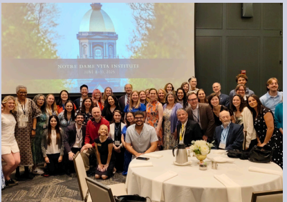
Vita Institute at the University of Notre Dame Final Banquet