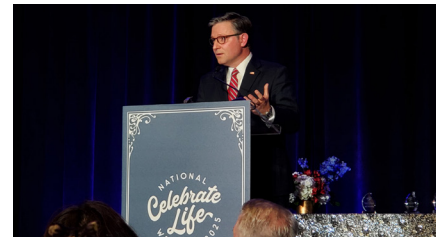
Speaker of the House Mike Johnson