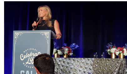
Riley Gaines at Celebrate Life

The following week, we attended the Celebrate Life Conference in Washington, D.C. , bringing together students, pregnancy centers, sidewalk advocates, and pro-life supporters. This year, we joined the Celebrate Life Rally to Defund Planned Parenthood , aiming to organize a large diaper drive. It was a rewarding experience!