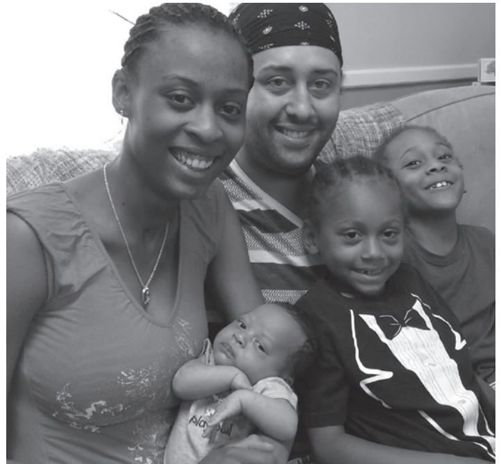
Recent graduates of the center’s parenting classes.

P.S. Watch for updated fact cards which support both pregnancy centers and sidewalk counselors next month. These make great pamphlet rack inserts at churches, grocery stores, and high school nurse offices.