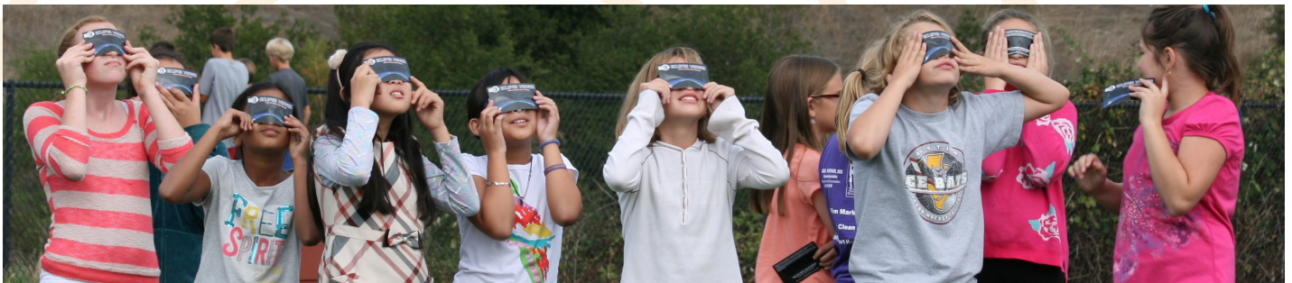
Young children learn how to use safe solar viewers to observe the Sun.

The upcoming April 8, 2024 Total Solar Eclipse offers a rare opportunity to transform how people relate to science and scientists – which in the face of science skepticism and the existential threat of the climate crisis – is more important now than ever.