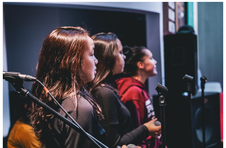
A couple girls from Pangnirtung who will be a part of our Champions of Hope