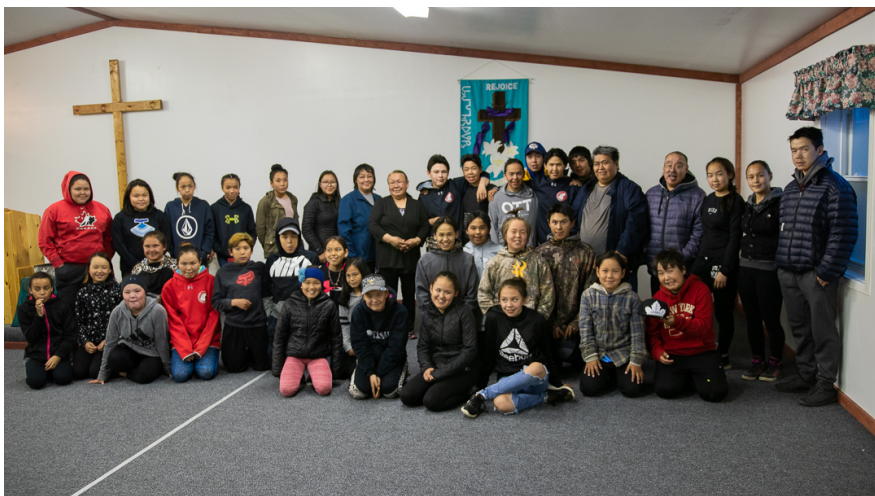
Some of the young people in Pangnirtung who have come through our Arctic Hope Program!