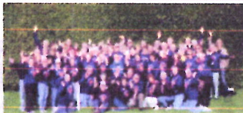
For more information on the exciting world of float decorating, visit our website at WWW.LUTHERTOURS.COM

Or, contact LutherTours for assistance with processing your online registration.