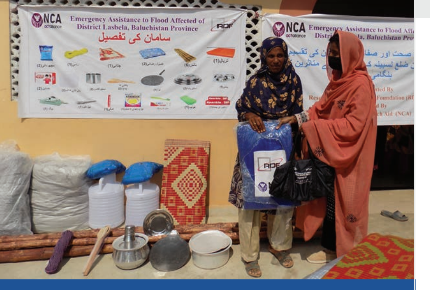
Our ACT Alliance partner in Pakistan, Norwegian Church Aid (NCA) distributed hygiene kits, jerry cans, mosquito nets, and shelter kits to those affected by the floods.