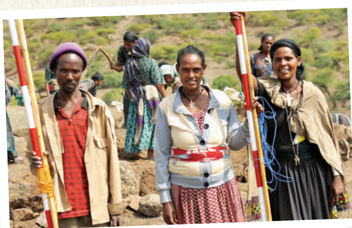
Farmers in Lalibela, Ethiopia practice conservation farming techniques.

Global gender inequality causes significant harm to women and girls and limits our collective potential to respond to global challenges such as climate change, poverty and displacement. By addressing the barriers that women and girls face in accessing necessary resources such as training, financial services and productive assets, and by supporting them to be leaders in their communities, women and girls can play an active role in strengthening their households and encouraging collective action. Join the Beaverbrae Society to support women and girls across the world by giving them equitable access to rights, resources and the opportunities they need to embrace their full potential.